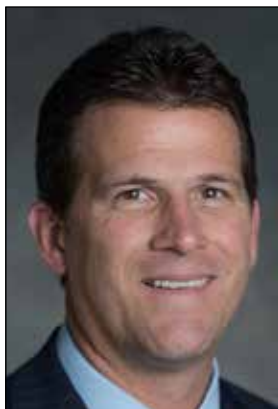
Steve Alford Head Coach - 1st Year